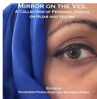
Publications Reflections on the Veil: An art work in Yemen and an experiment in Germany 2017, Essay, Essay, Own writing