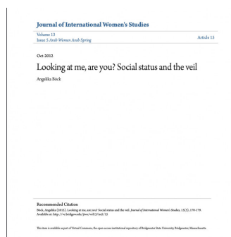
Publications Looking at me, are you? Social status and the veil 2012, Journal Article, Own Writing