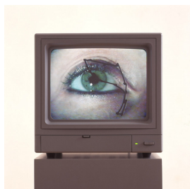
Artworks eye2eye 2000, Eye-tracking, Videoinstallation