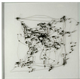
Artworks Blanks 1996, Eye-tracking