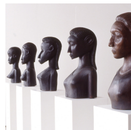
Artworks StillePost 1999, Installation, Contributive, Portrait as Dialogue