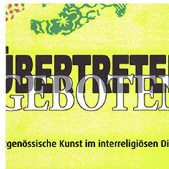
Exhibitions Übertreten geboten, Zeitgenössische Kunst im interreligiösen Dialog 2010, Group Exhibition