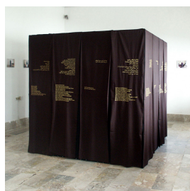
Artworks Imagine Me 2007, Installation, Contributive, Portrait as Dialogue