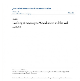
Publications Looking at me, are you? Social status and the veil 2012, Journal Article, Own Writing