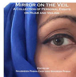
Publications Reflections on the Veil: An art work in Yemen and an experiment in Germany 2017, Essay, Essay, Own writing