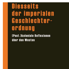
Publications Was bilden wir uns eigentlich ein? 2014, Book chapter, Own writing