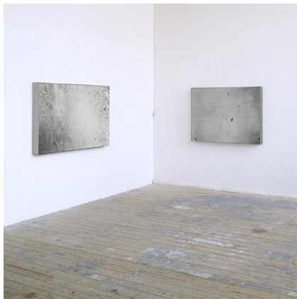
Artworks Smell Souvenir 1998, Installation