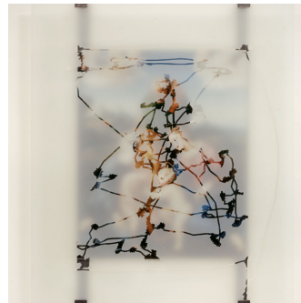
trans-parent (Raphael) 1996, Eye-tracking