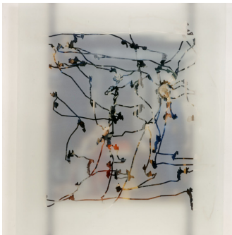
trans-parent (Fra Filippo Lippi) 1996, Eye-tracking