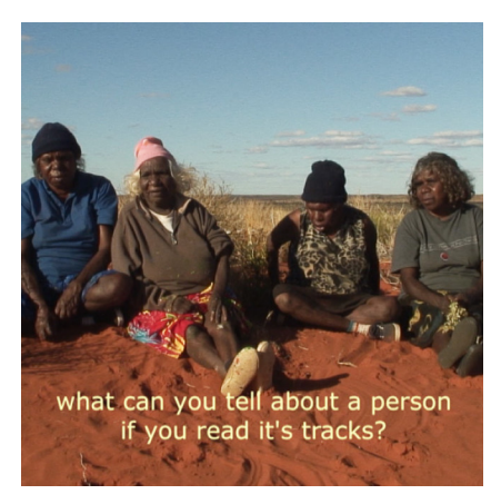
Track Me 2006, Videoinstallation, Contributive, Portrait as Dialogue