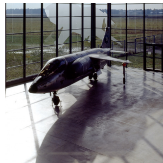
Artworks Time Period 1994, Installation