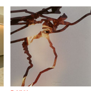
Exhibitions trans-parent 1998, Solo Exhibition

Publications In Between Glances 2015, Journal Article, Own writing