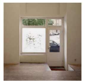
Publications Spuren des Sehens 2016, Journal Article, Own writing