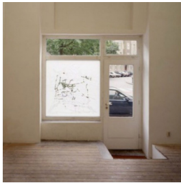
Publications Spuren des Sehens 2016, Journal Article, Own writing