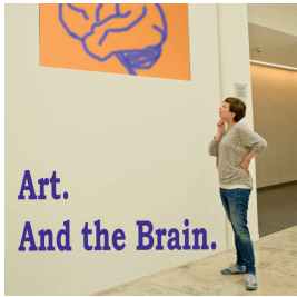
Publications In Between Glances 2015, Journal Article, Own writing