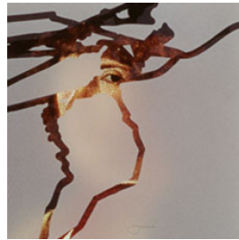
Exhibitions trans-parent 1998, Solo Exhibition