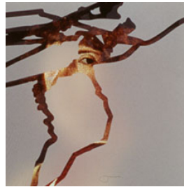
Exhibitions trans-parent 1998, Solo Exhibition