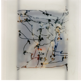
Artworks trans-parent (Fra Filippo Lippi) 1996, Eye-tracking