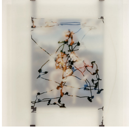
Artworks trans-parent (Raphael) 1996, Eye-tracking