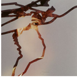
Exhibitions trans-parent 1998, Solo Exhibition