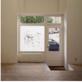
Publications Spuren des Sehens 2016, Journal Article, Own writing