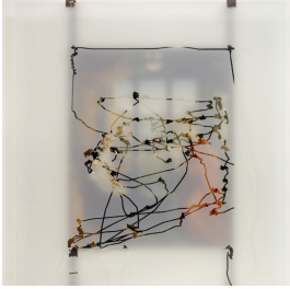
Artworks trans-parent (Rogier van der Weyden) 1996, Eye-tracking