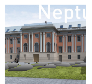
Artworks Neptune's Field 2011, Competition ent

Artworks Transformator 2010, Competition entry