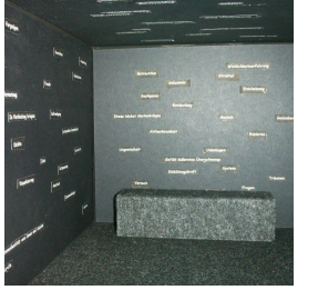
Artworks Studiolo 2007, Competition entry

Artworks Parabel 2018, Competition entry