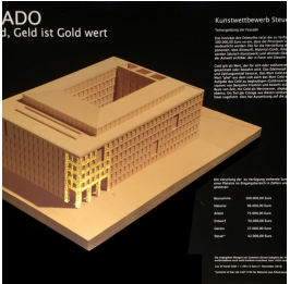
Artworks Eldorado: Time is money, money is gold 2017, Competition entry

Artworks Shuttle 2009, Competition entry