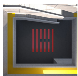
Artworks Transformator 2010, Competition entry