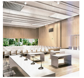
Artworks Jungle 2014, Competition entry