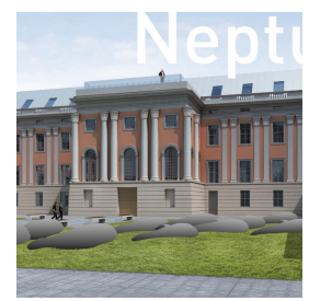
Artworks Neptune's Field 2011, Competition entry