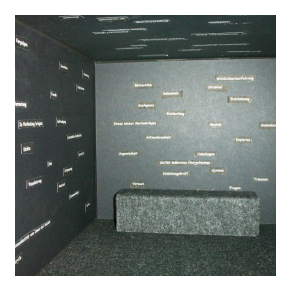
Artworks Studiolo 2007, Competition entry