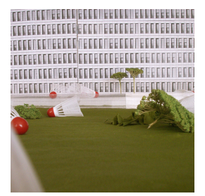
Artworks Shuttle 2009, Competition entry