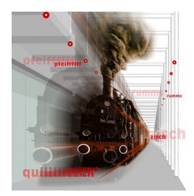
Artworks Fang mich doch (Catch me then) 2003. Competition entry