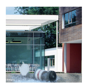
Artworks Fire Water 2010, Competition entry