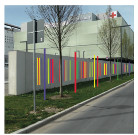
Artworks Sequence 2015, Competition entry