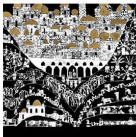
Exhibitions Between Ebal and Gerzim (Documentation) 2011, Group Exhibition