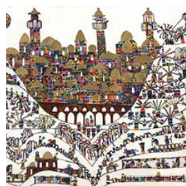
Exhibitions Between Ebal and Gerzim 2011, Group Exhibition