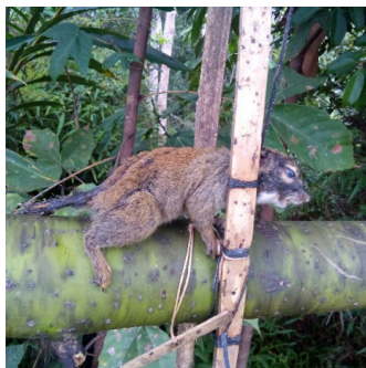
Projects LIFE PRACTICES