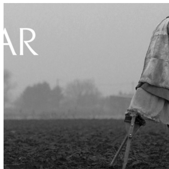
Events ROAR 2021, Group Exhibition