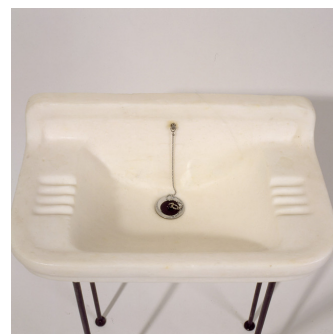
Artworks Sink 1992, Installation, Contributive