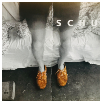
Exhibitions Schuhe 1997, Group Exhibition