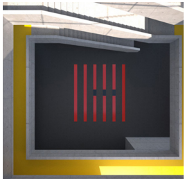
Artworks Transformator 2010, Competition entry