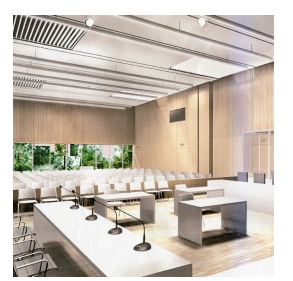
Jungle 2014, Competition entry