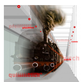
Artworks Fang mich doch (Catch me then) 2003, Competition entry