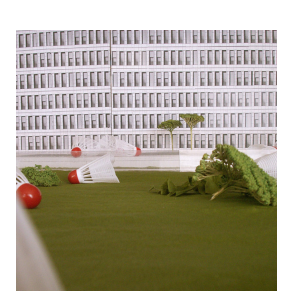
Artworks Shuttle 2009, Competition entry