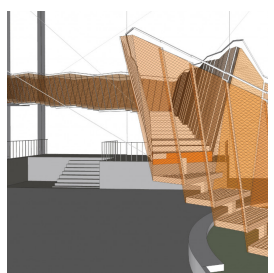
Artworks Bavarian Rise 2018, Competition entry