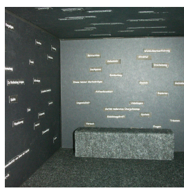
Artworks Studiolo 2007, Competition entr